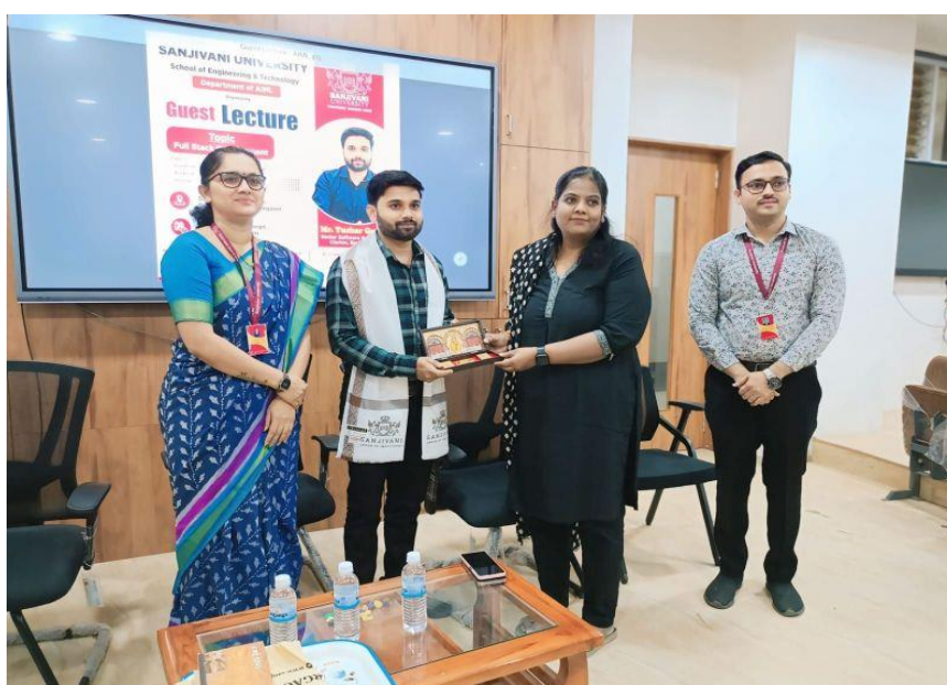
Fig.24. Guest Lecture on Full Stack Development at AIML

Guest Lecture on Full Stack Development at AIML, Sanjivani University, His session provided our first and second-year AIML students with a comprehensive understanding of both front-end and back-end technologies, industry trends, and valuable real-world insight