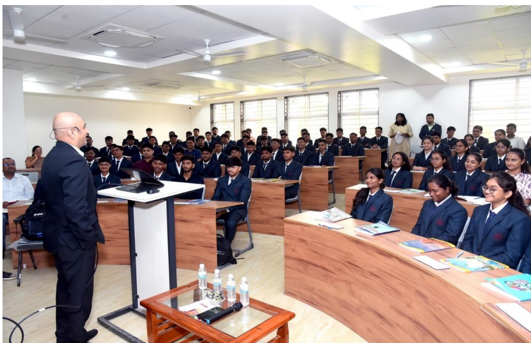
Fig.5: First Year B.Tech Induction Program