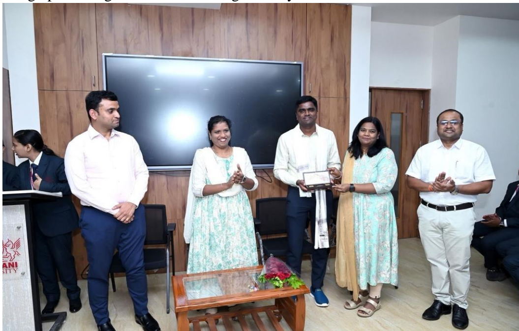
Fig.11. Direct Second Year B.Tech Induction Program