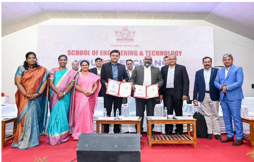
Fig.15. MoU with Fortinet

Fortinet, a global leader in cyber security solutions has established a Centre of Excellence, “Fortinet Centre of Excellence” in Sanjivani University on 28 th August 2024. This centre of excellence is aimed at enhancing product development and real time projects for B.Tech CSE (Cyber Security) Programme. This initiative aims to bridge the gap between academic learning and industry requirements, preparing students for careers in cyber security.