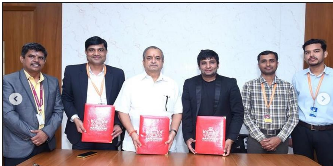
Fig.20: MoU Signing Ceremony with Zoho Corporation

A Memorandum of Understanding (MoU) was signed between Zoho Corporation and Sanjivani University to establish a collaborative platform for skill development, innovation, and industry-oriented education.