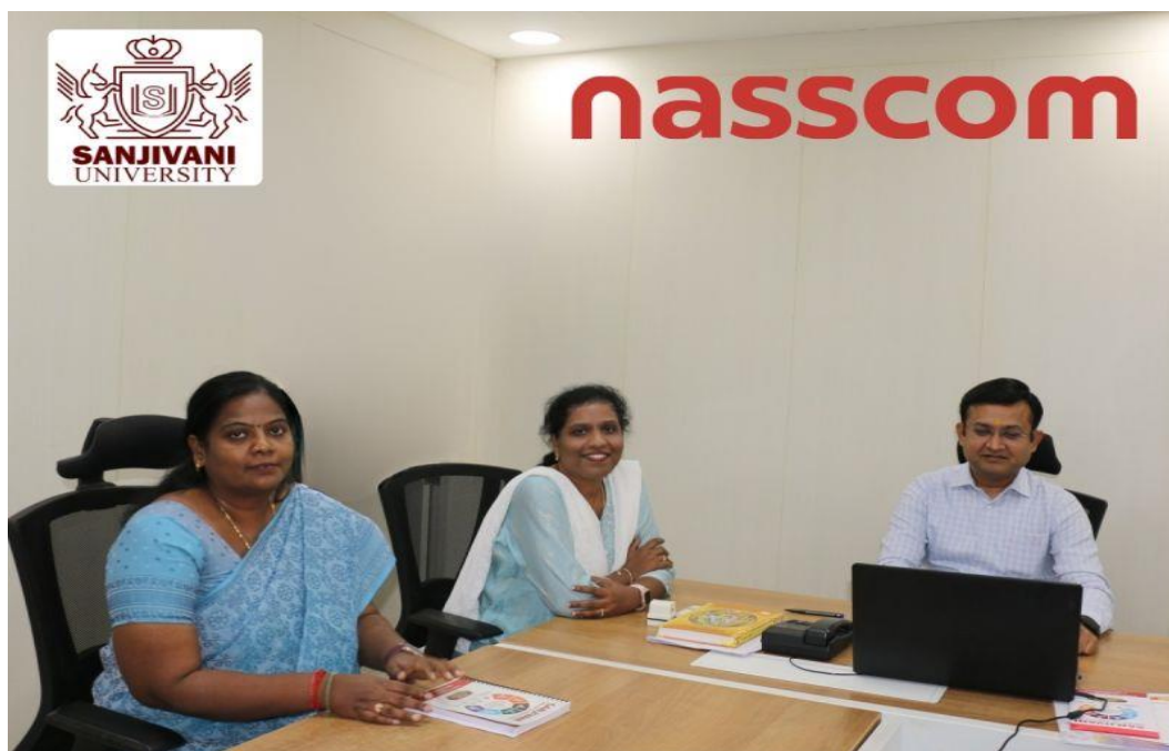
Fig.13: MoU with NASSCOM

Sanjivani University has a signed MoU with NASSCOM / IT-ITES Sector Skills Council to undertake Future skills prime Certifications in emerging technologies. This MOU marks the beginning of a dynamic collaboration aimed at enhancing educational experiences and opening up new opportunities for our students and faculty.