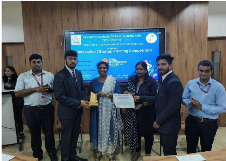
Fig.25. Prize distribution of Startup Pitching Competition

Department of Artificial Intelligence and Data Science, School of Engineering & Technology, Sanjivani University organized a Startip Canvas-Poster Making Competition