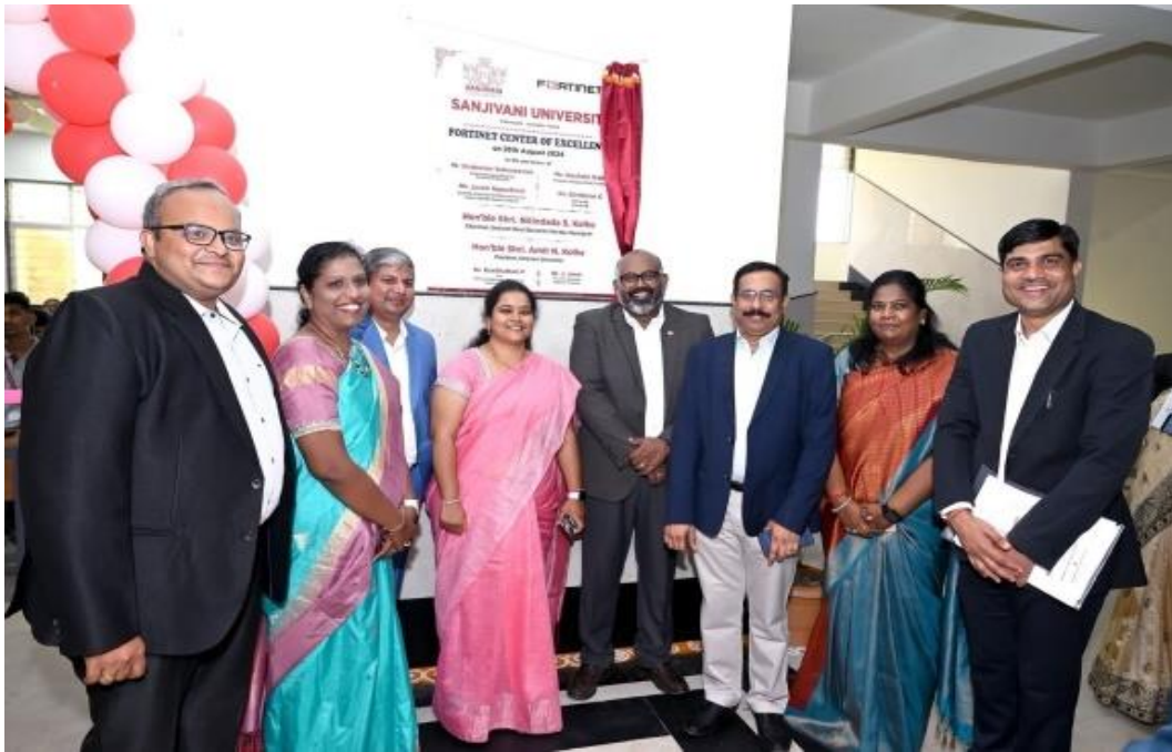
Fig.16: Opening Ceremony of the FORTINET Centre of Excellence