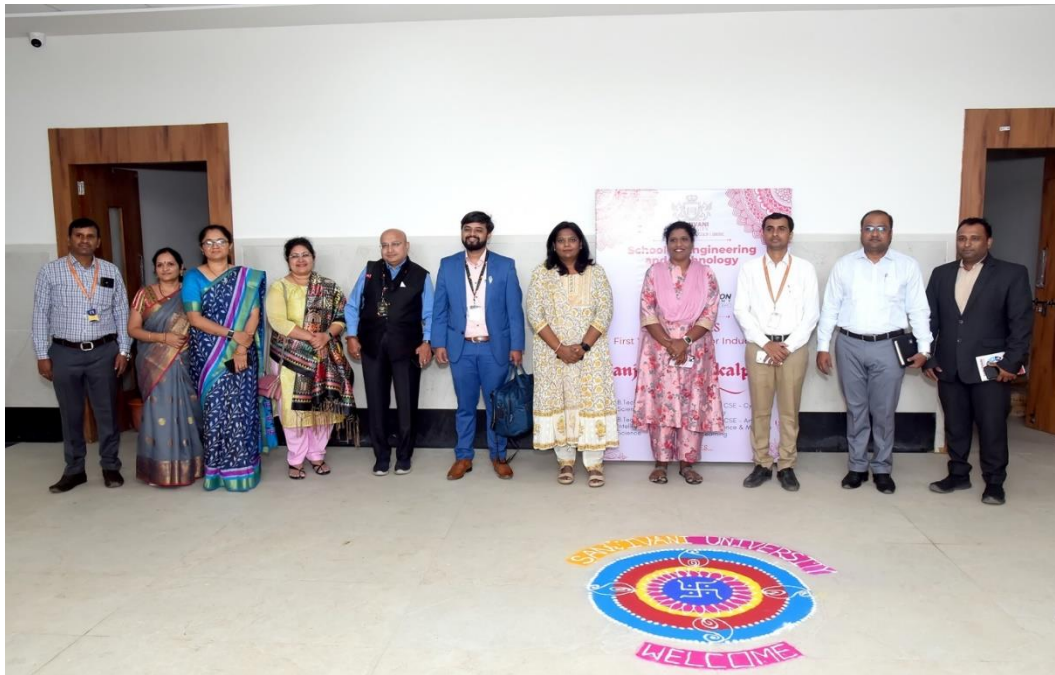
Fig.3. First Year B.Tech Induction Program