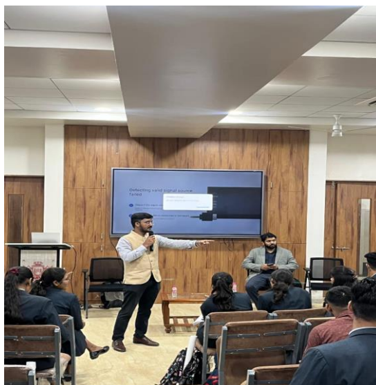
Fig.30: Guest lecture on Financial Literacy