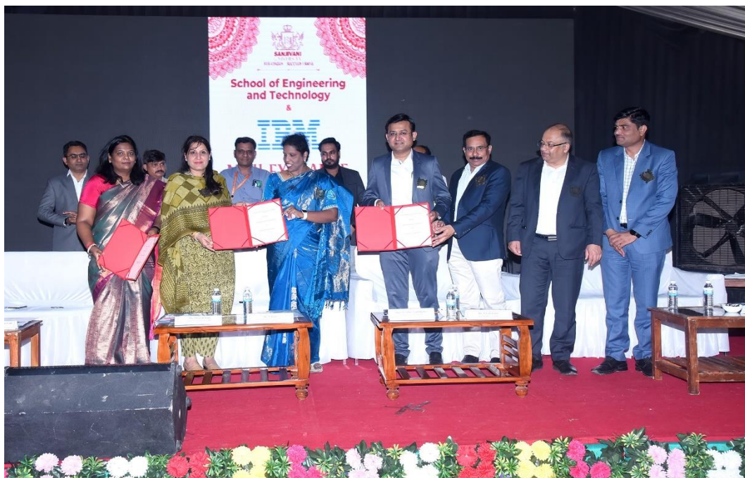
Fig.14. MoU with IBM and CareerTiQ

Fortinet, a global leader in cyber security solutions has established a Centre of Excellence, “Fortinet Centre of Excellence” in Sanjivani University on 28 th August 2024. This centre of excellence is aimed at enhancing product development and real time projects for B.Tech CSE (Cyber Security) Programme. This initiative aims to bridge the gap between academic learning and industry requirements, preparing students for careers in cyber security.