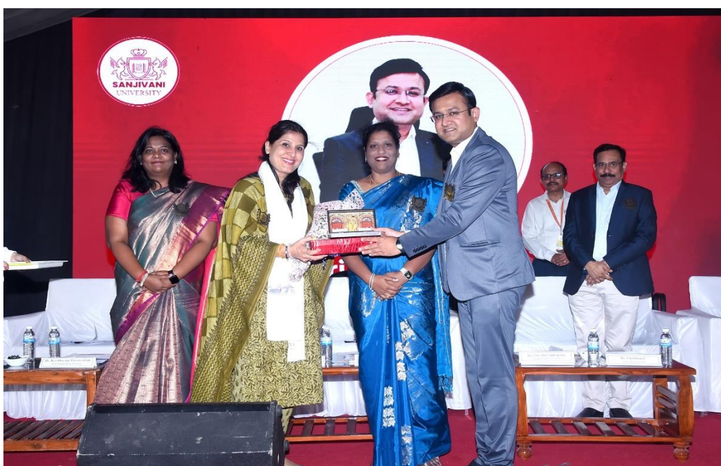
Fig.2. First Year B.Tech Orientation Program

The induction day for our B.Tech programs, “Sanjivani Sanklap” was held on 22 nd July 2024.