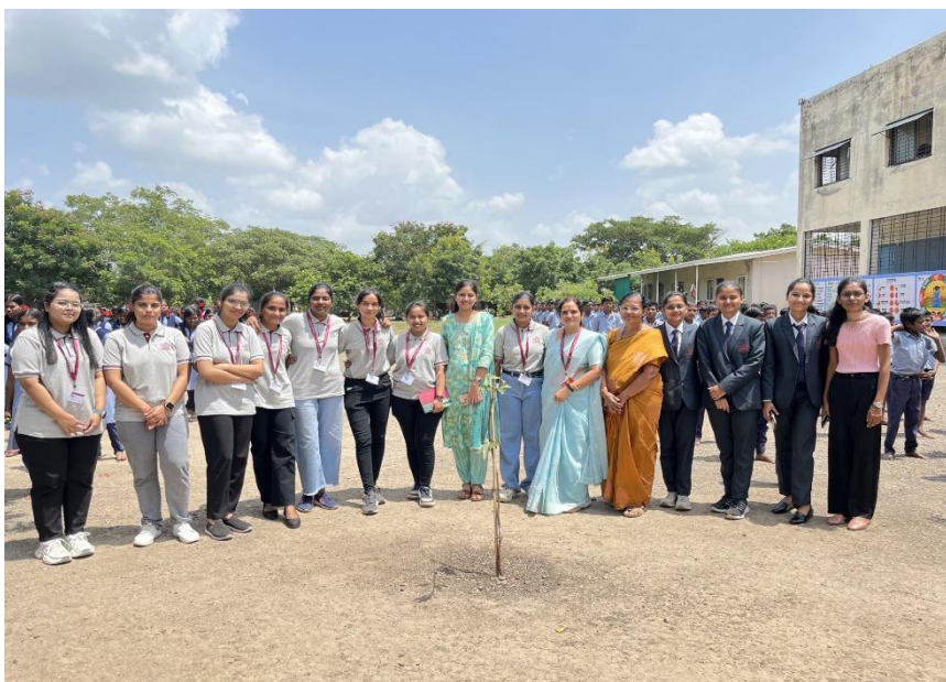
Fig. 27: Social Immersion Activities - Swachhata Pakhwada