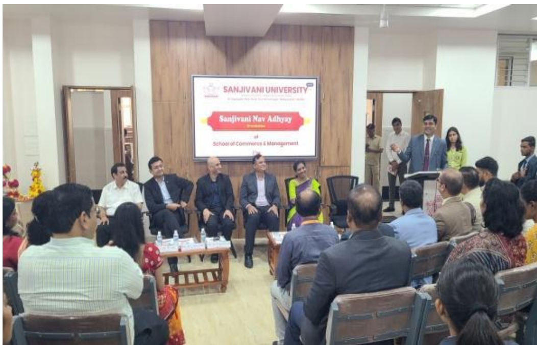
Fig.1. BBA & BCOM Orientation Program

The school of Management commenced their academic programs, BBA & BCOM with the induction day “Sanjivani Nav Adhyay” on 15 th July 2024.