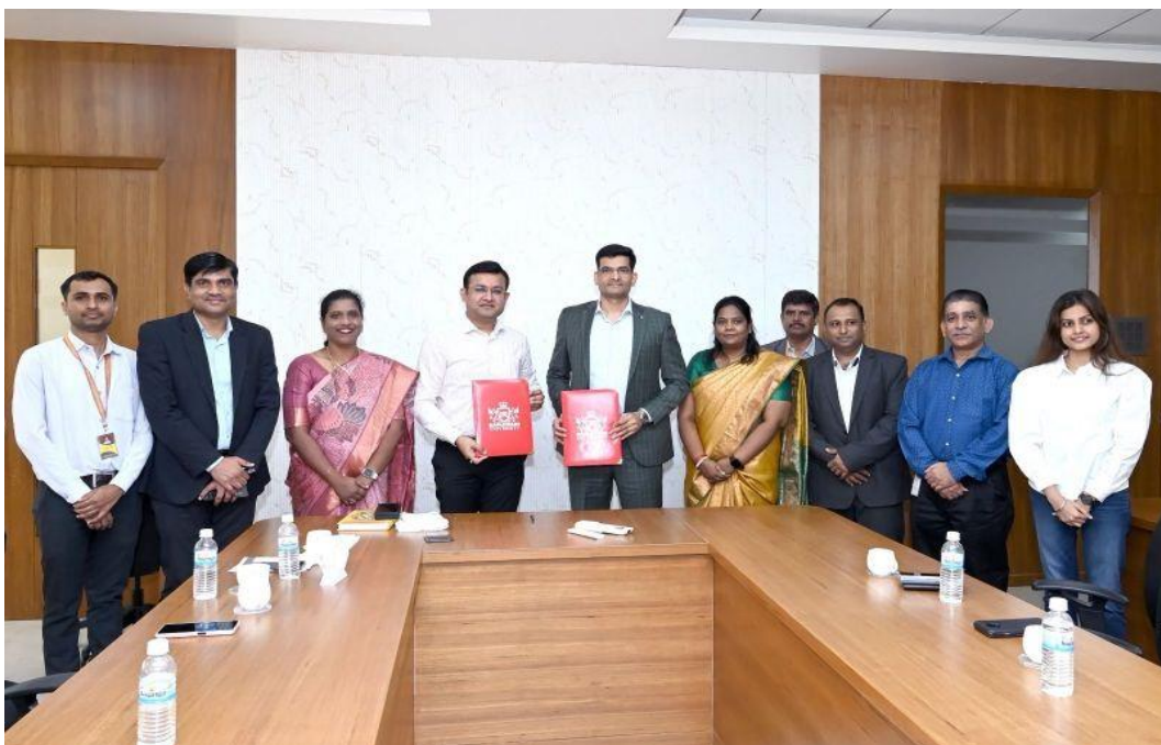
Fig.17: MoU with Mytek Innovations Pvt Ltd

Mytek Innovations Pvt Ltd signed a MoU with Sanjivani University for student's internships, placements, joint execution of Research projects and consultancy services.