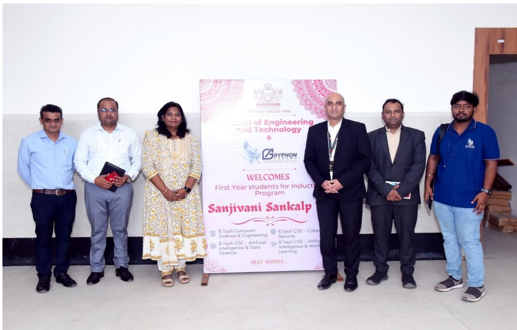
Fig.4: First Year B.Tech Induction Program