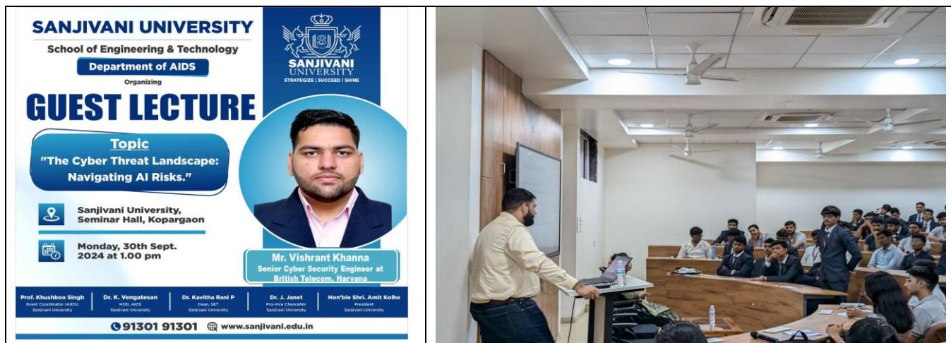
Fig.29: Guest Lecture of Cyber Threat Landscape: Navigating AI Risk