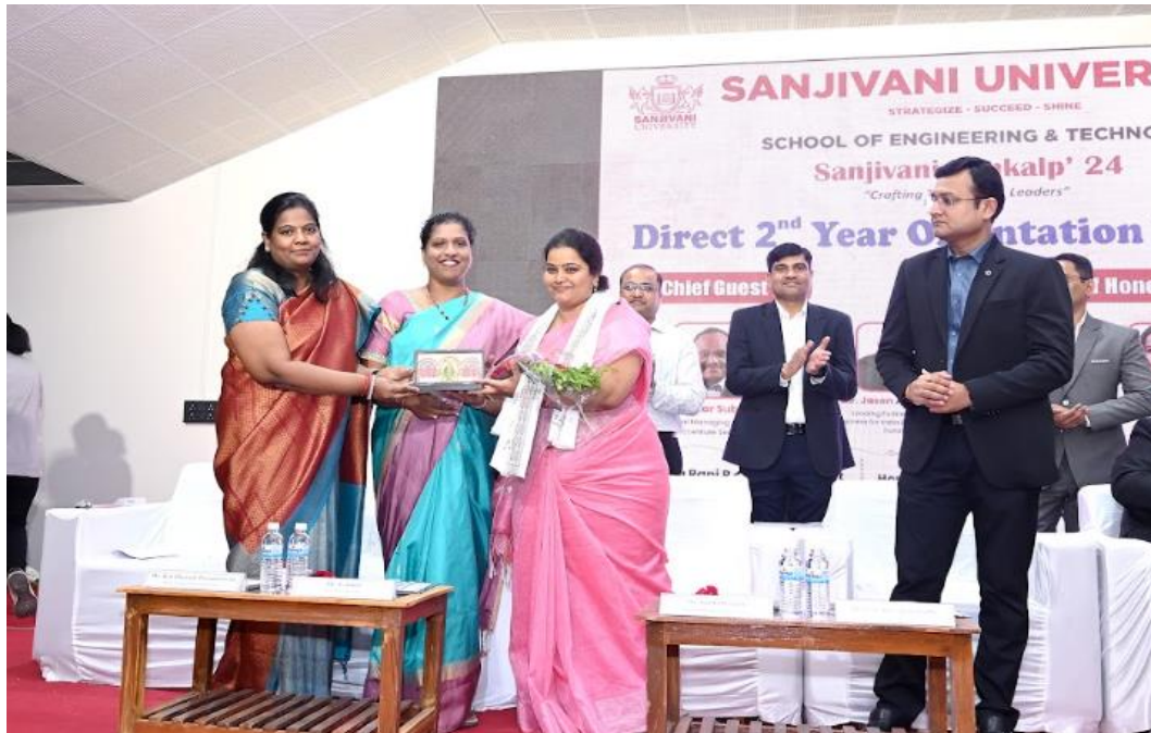
Fig.10. Direct Second Year B.Tech Orientation Program