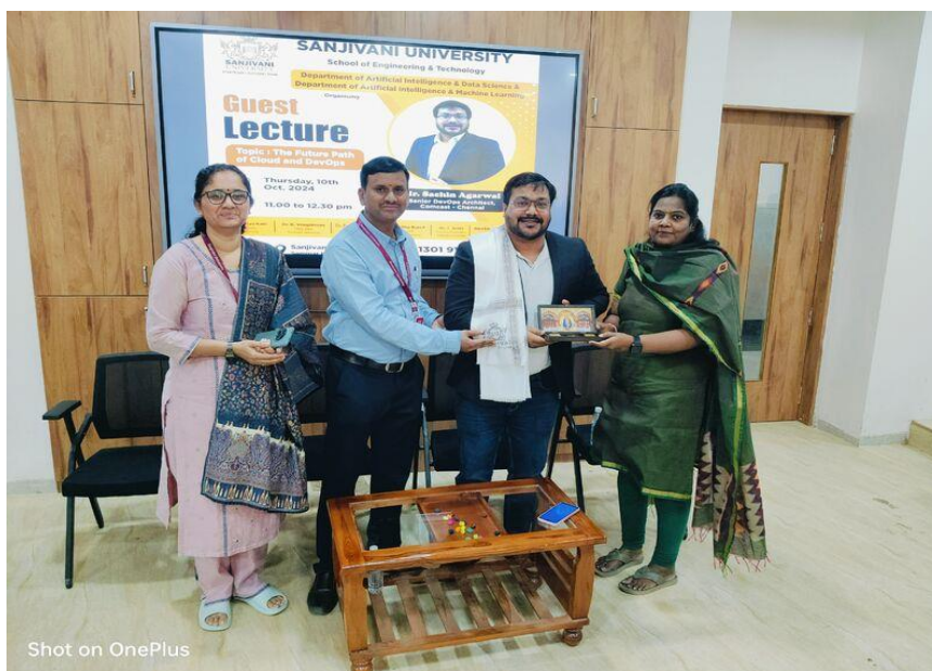
Fig.23. Guest lecture on “The Future Path of DevOps

Guest Lecture on Full Stack Development at AIML, Sanjivani University, His session provided our first and second-year AIML students with a comprehensive understanding of both front-end and back-end technologies, industry trends, and valuable real-world insight