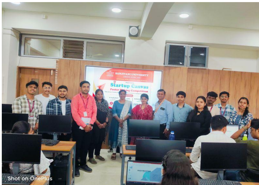
Fig.26. Startup Canvas Poster Competition

Department of Artificial Intelligence and Data Science, School of Engineering & Technology, Sanjivani University organized a Startip Canvas-Poster Making Competition