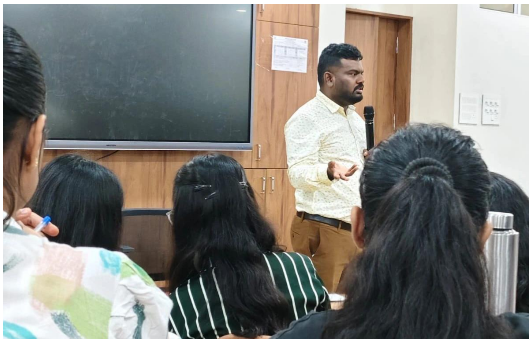
Fig.12. Direct Second Year B.Tech Induction Program