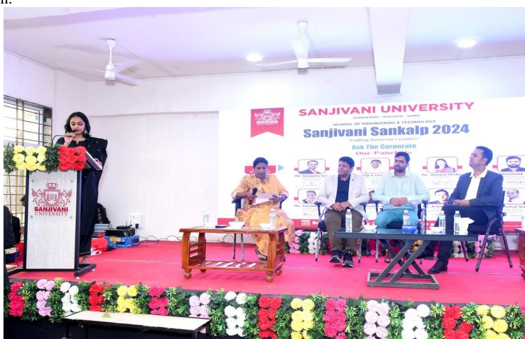
Fig.6. Ask the corporate -Panel discussion on Beyond the Basics in the AI Era

Explored insights into navigating the evolving AI landscape and its impact on business and talent acquisition.