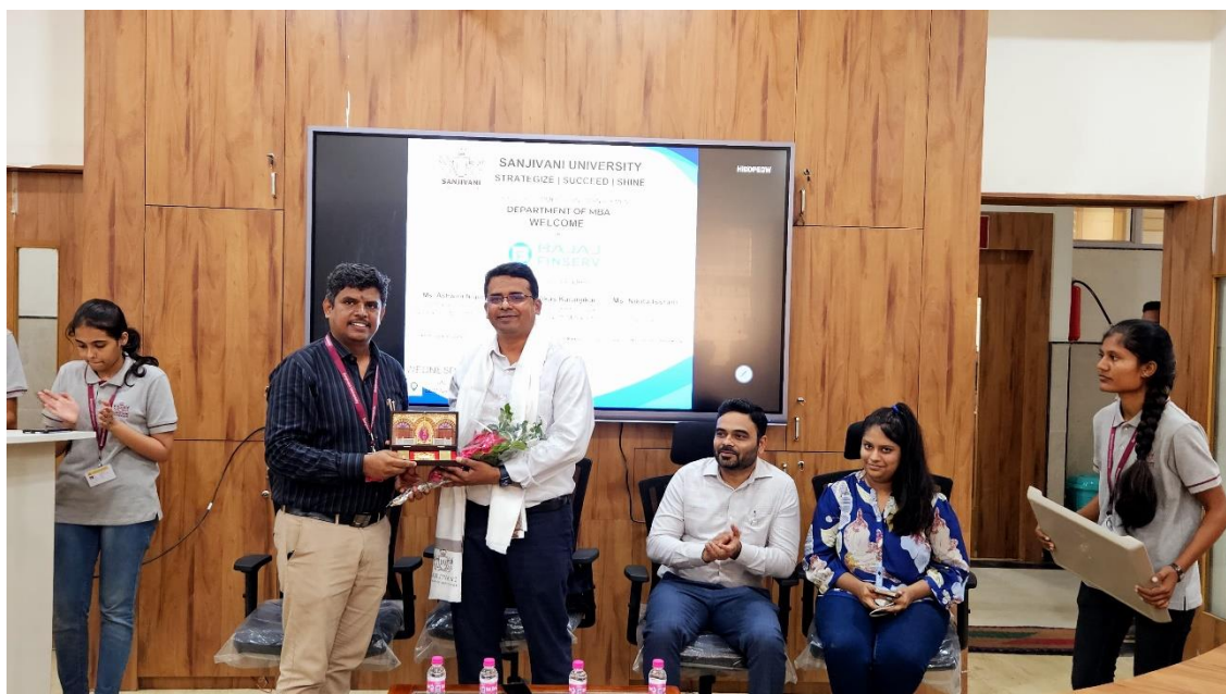
Fig.19: MoU Signing Ceremony with Bajaj Finserv Ltd

The Memorandum of Understanding (MoU) was signed between Bajaj Finserv Ltd. and Sanjivani University , marking a strategic collaboration to foster skill development, industry-academia partnership, and career opportunities for students. This partnership aims to bridge the gap between academic learning and industry requirements, providing students with hands-on training and professional growth avenues. The signing ceremony was a milestone event, reinforcing the university's commitment to excellence in education and industry integration.