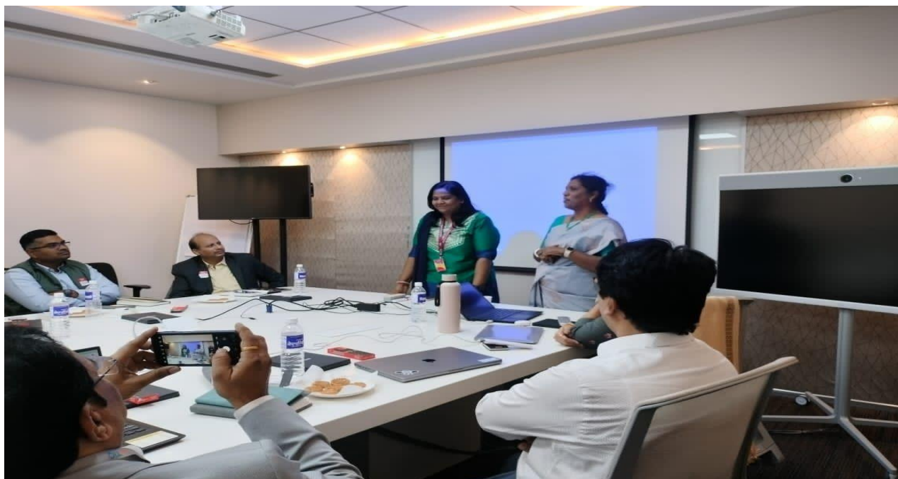
Fig.34: SU Leaders Interaction with Industry Experts