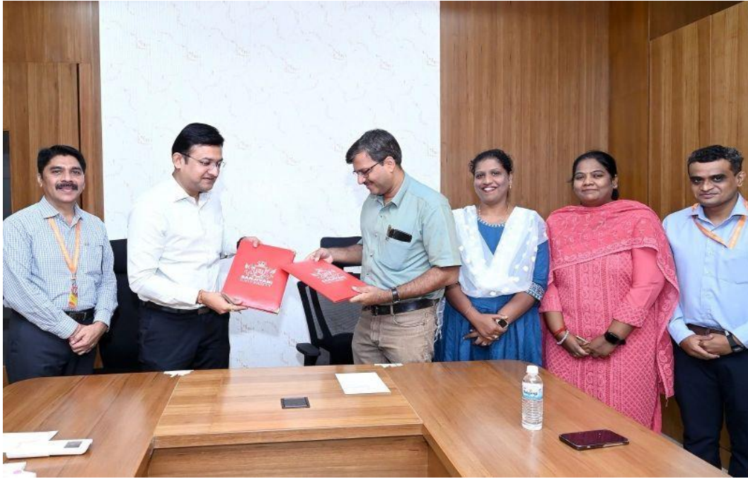
Fig.18: MoU with Vigyan Ashram

Sanjivani University and Vigyan Ashram, Pabal has signed a for Students internship, Design thinking sessions and Faculty Joint Research initiatives.