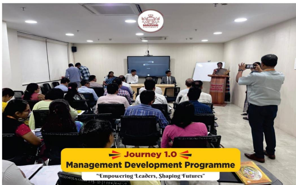
Fig.21: Management Development Program for all Faculty

Raas & Rise: The Celebration of Leadership,' where we inaugurated our Student Council amidst the vibrant festivities of Navaratri. This event honoured the spirit of Navaratri, celebrating the triumph of good over evil through dance, music, and tradition.