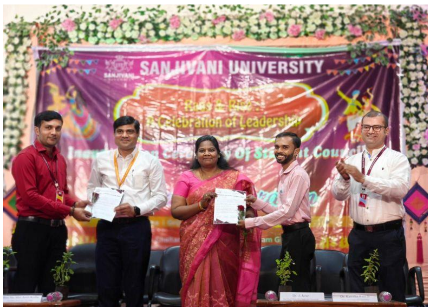
Fig.22. Raas & Rise: The Celebration of Leadership

Raas & Rise: The Celebration of Leadership,' where we inaugurated our Student Council amidst the vibrant festivities of Navaratri. This event honoured the spirit of Navaratri, celebrating the triumph of good over evil through dance, music, and tradition.